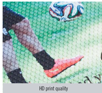
HD print quality